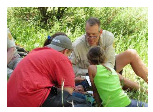
KIN Hike-Compass Lesson

file of the receipt, contact Sandy Sticken for details. Please include information as to the event or committee for which the purchase has been made. For appropriate accounting documentation, a receipt needs to show the store name, date of purchase and amount of purchase.