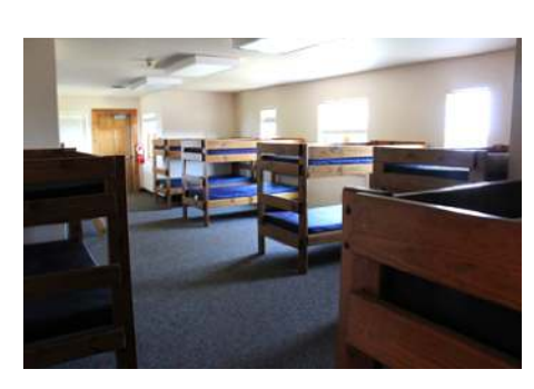
Bunk Beds at Buckhorn Ranch

Mark May 17-19 on your calendar. Hope to see you there!