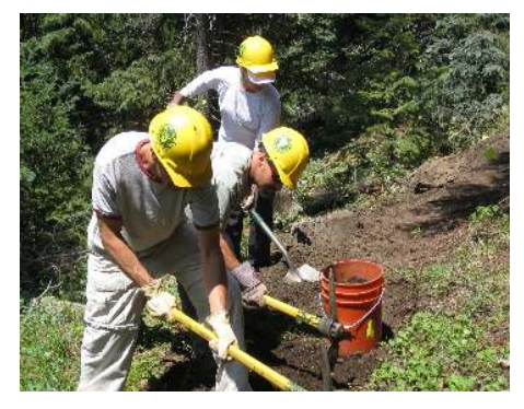
PWV Working on the Trail