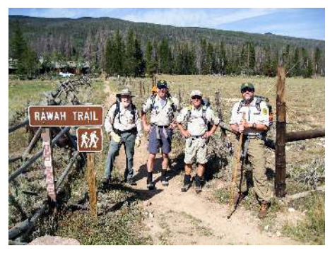
PWV Members on Patrol

"This 24-year-old all-volunteer organization now has about 320 members, aged 18-over 80, who ride and hike with a purpose, serving the US Forest Service and everyone who values our wilderness."