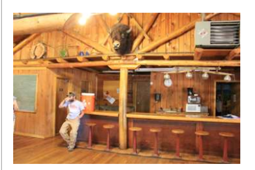
Buckhorn Ranch Dining Hall

"PWV's are glad to see the 'Federal Shutdown' over. Folks may have noticed members on their own cleaning toilets at Poudre and Red Feather Trailheads. Thanks to all the 'citizen volunteers'!"