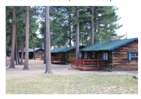
Buckhorn Ranch in Rist Canyon

Who is Spring Training for? Well, certainly it's for the traditional attendees who are new recruits, Animal Group