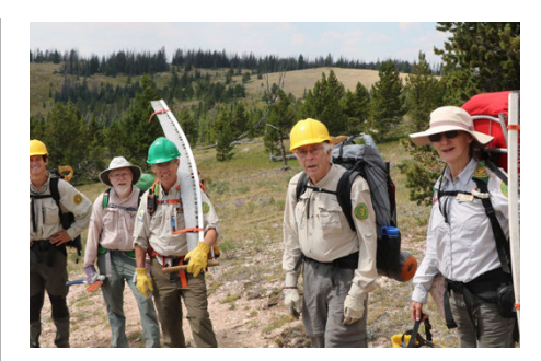
PWV Trail Members

Anyone and everyone in PWV can clear almost any tree from the trail as long as they are comfortable doing so and it is safe for them to do.