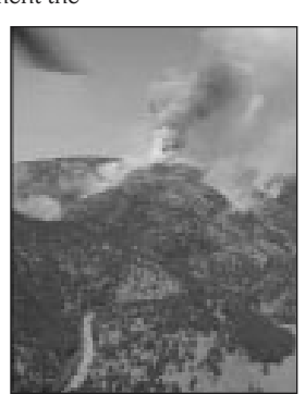
The Big Elk Fire makes a run on Kenny Mountain last summer. The Front Range Strategy will help reduce the risk of catastrophic wildfire.

Trees cut at Dowdy Lake will be used for public firewood. Tree limbs and left-over material has been placed in piles. Most piles will be burned; however, one per acre will be left to benefit wildlife, such as rabbits and other small mammals.