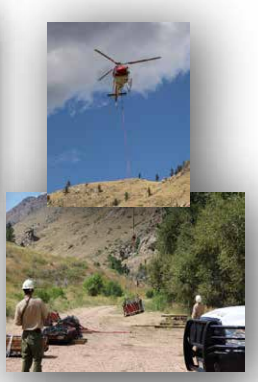
It takes a village...and a helicopter to haul in 600 pound beams and lumber for bridges. October, 2019